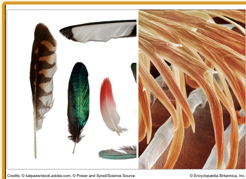
A screen capture of the "Feather: Magnified" interactive on "Britannica School."

From interactive experiment examples to detailed articles on a wide range of science disciplines, there is something for every student. Help your students elevate their science fair projects with "Britannica School."