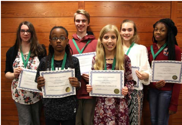
2018 LAL Winners

Center for Civic Life Advisory Board, reviewed for Booklist , and judged for the Foreward INDIES awards. She is also a proud graduate of the Granger Leadership Academy. In her new position, she looks forward to traveling all over her home state's highways and back roads, visiting libraries and librarians working to provide the best possible service to communities. She thinks something powerful happens in a space where all are welcome and treated the same.