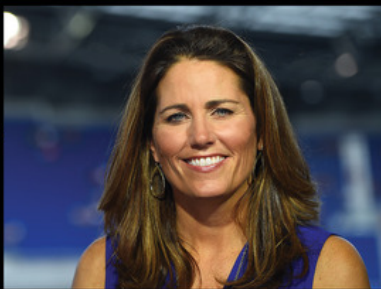
Honorary Chair Julie Foudy

#NationalLibraryWeek #LibrariesTransform