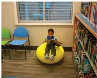
A young patron enjoys reading in the new children's department.