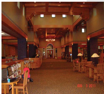
An interior view of the library.