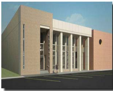
An exterior view of the Gulfport Library