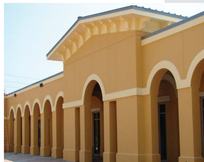
An exterior view of the Biloxi Library.

Local foods such as Pusherata, pralines, French breads, and jambalaya were made by the local community and donated to the library for the celebration.