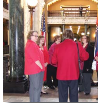
Librarians, dressed in red for Library Advocacy Day, shown here discussing the distribution of the "Pie Bags".

Thursday, March 10, library supporters observed Library Advocacy Day, also known as "Pie Day." Librarians gathered at the State Capitol, dressed in red and carrying white bags with blue and white state-shaped tags that read, "Remember libraries when slicing the pie." Inside were small tasty pecan pies.