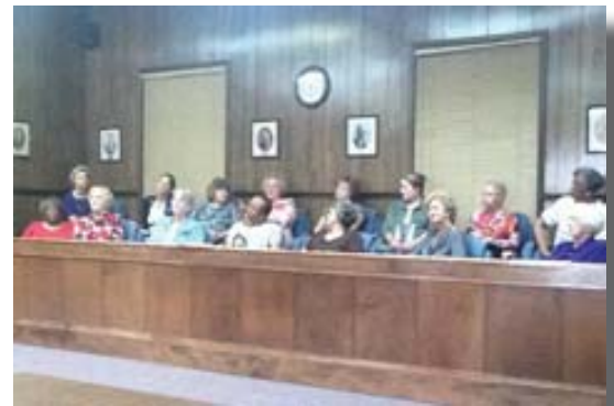
Pictured are the Waynesboro-Wayne County Library Between The Lines Book Club members as they discussed the verdict of Mary Surratt.

The Between the Lines Book Club meets every third Thursday at the Waynesboro-Wayne County Library.