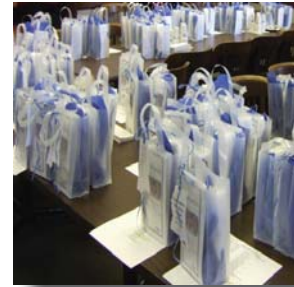
Shown are the "Pie Bags" arranged alphabetically by library system for distribution to legislators.